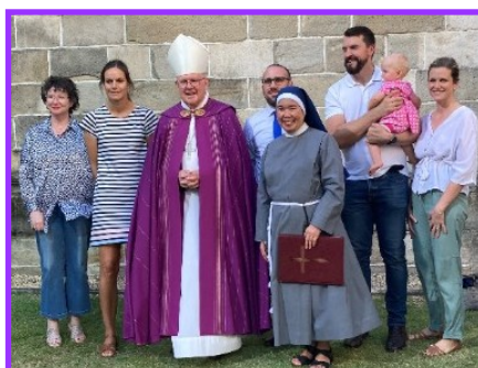
Rite of Election at St Stephen's Cathedral on the 26th of February 2023.

Are you interested in becoming Catholic or learning about the Catholic faith? Welcome! The Catholic Church's mission is to offer people of all ages and backgrounds the opportunity to deepen their understanding and relationship with Jesus Christ. Becoming Catholic involves a journey of faith accompanied by the support of a parish community. This process is called the Rite of Christian Initiation of Adults (RCIA). During the RCIA process, you meet with others to share, reflect, pray and learn more about the Catholic faith. Ceremonies or 'rites' at each stage signify the steps along the way. If you or someone you know would like to know more about becoming Catholic or learning more about their Catholic faith as an adult, please contact: 3398 1154 Email: stthomas@bne.catholic.net.au .