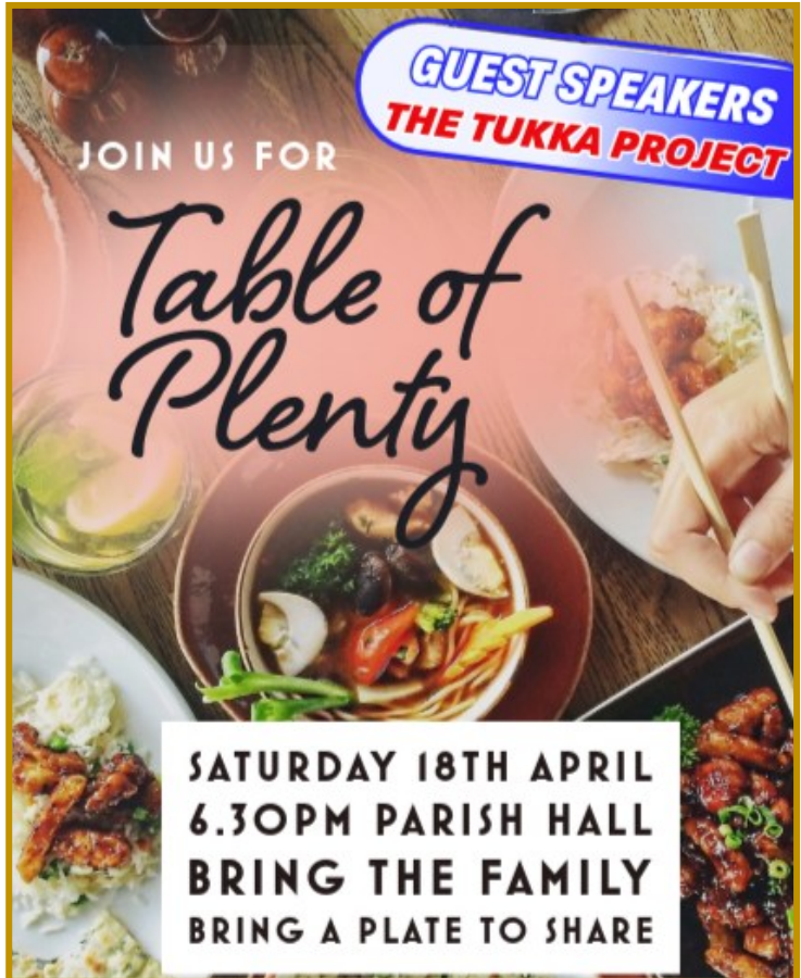
Table of Plenty

SATURDAY 18TH APRIL 6.30PM PARISH HALL BRING THE FAMILY BRING A PLATE TO SHARE