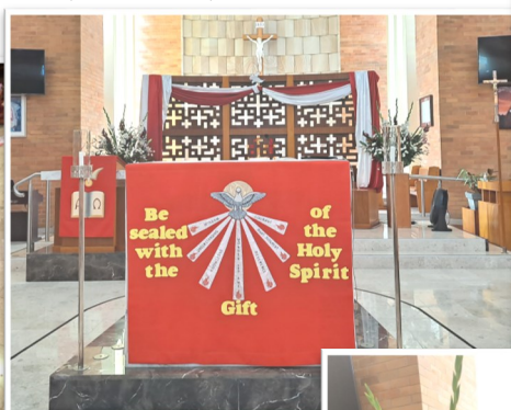
Our Church beautifully decorated for the Confirmation ceremonies