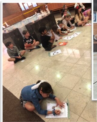
The children working hard at the Confirmation Workshop