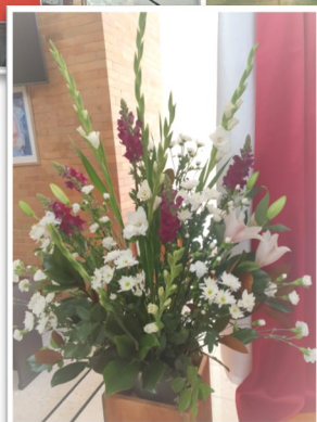
The floral decoration was amazing